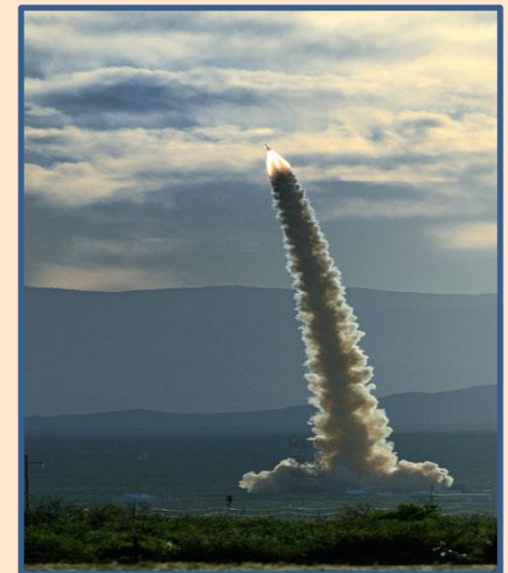
The Orion launch abort system lifts off during the Pad Abort 1 flight test on May 6, 2010 at the White Sands Missile Range.